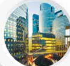
Buildings / Parking lots